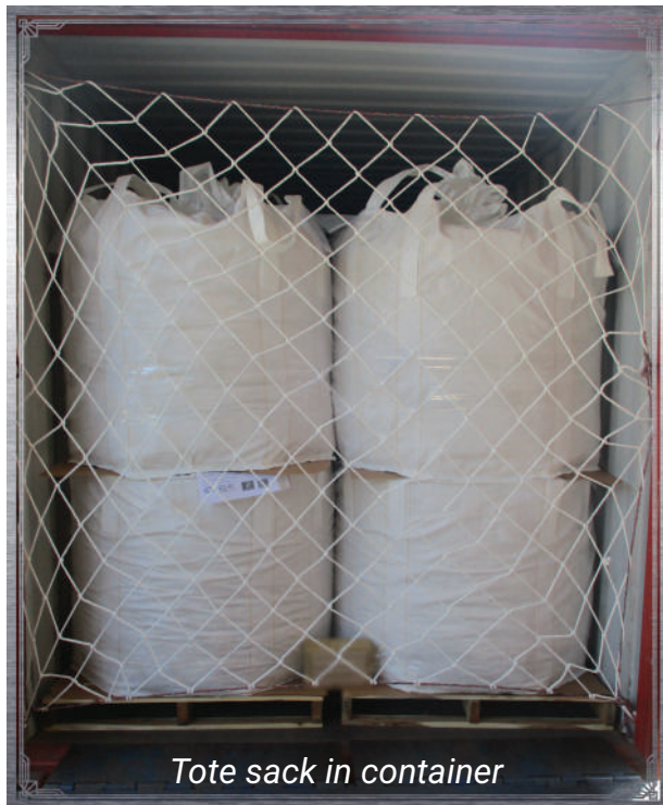
Tote sack in container