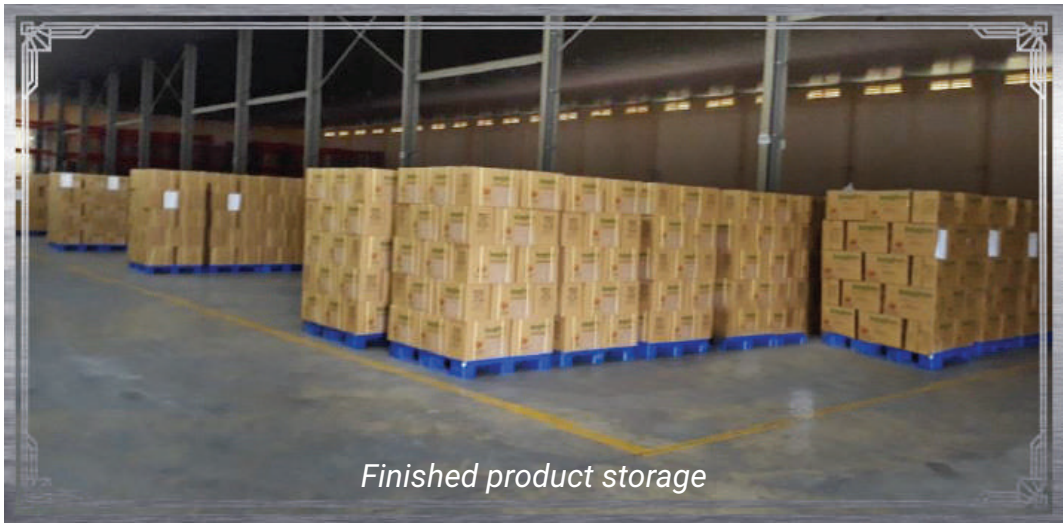
Finished product storage