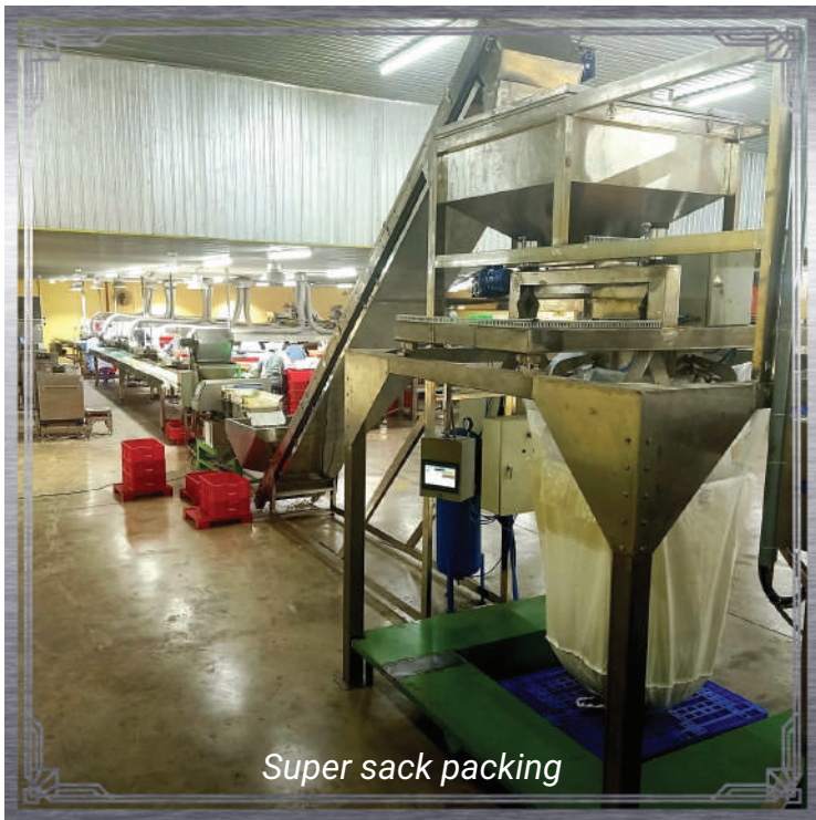
Super sack packing